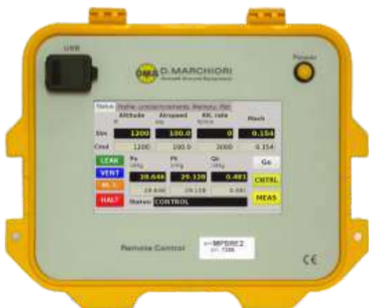
Optional MPSRE2 Multi-coloured backlit 7" LCD touchscreen hand terminal