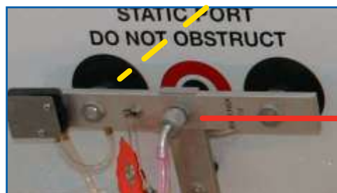
A wide range of pitot-static adaptors and adaptor kits are available from DMA